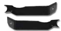
Upper Mounting Brackets